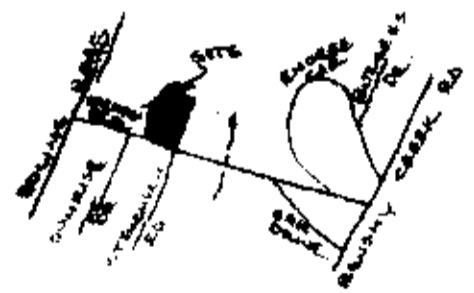
LOCATION MAP NO SCALE